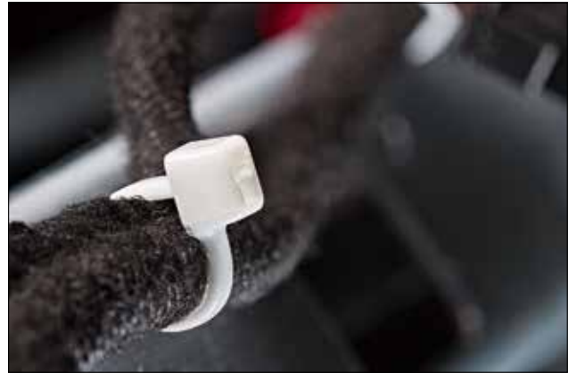
White T-Series cable ties for higher fire protection (PA66V0).