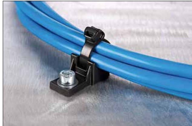
X-series provides a superior fixing solution for tight applications.