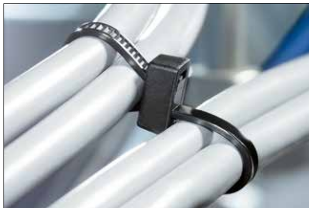
DH-Series cable ties for parallel routing.