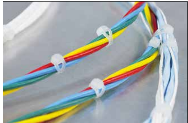
V-Series is perfect for parallel bundles.