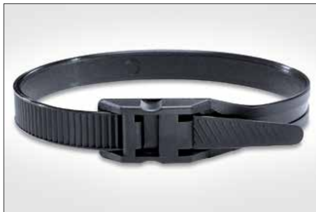
Low profile cable tie, LPH-Series.