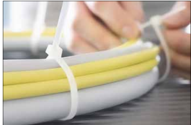
RELK releasable cable ties for temporary bundling.