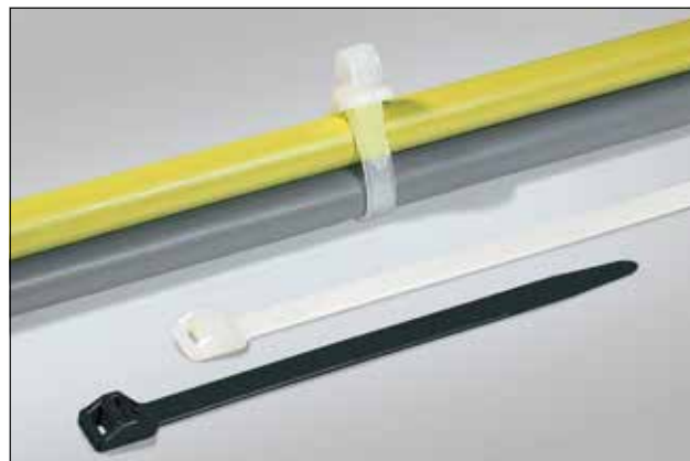
Ideal for larger or heavier bundles these ties can be opened and reused.