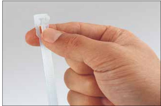
Releasable and reusable cable tie, REL-Series.