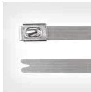
Stainless steel cable ties, uncoated, MBT_SS, MBT_HS.