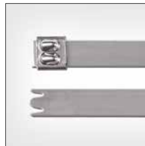
Stainless Steel Cable Ties, uncoated, MBT_XHS.