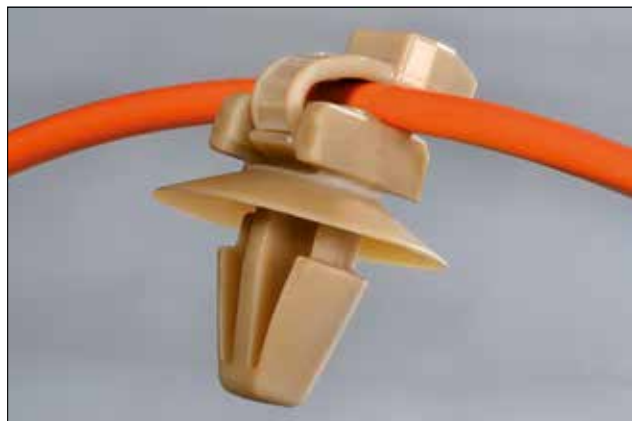
PEEK Fixing Ties can be used for small diameters from 1.0 mm.