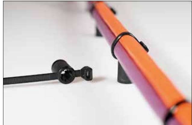
The T50SSBS50TE / T50SSBS60TE allows very precise routing of cable bundles.