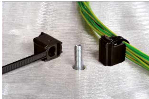
LFC165-2 for bundle diameters up to 35.0 mm