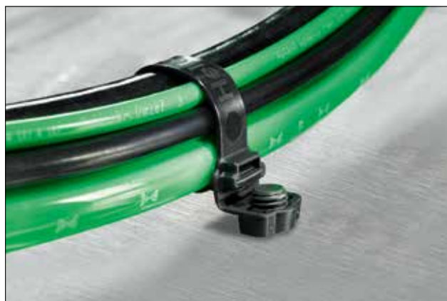
The wide strap stud mount cable tie minimizes pinching on soft bundles.