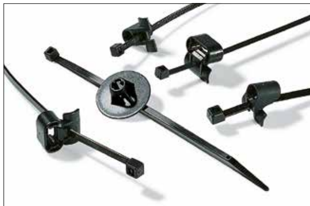
Cable ties illustrating the variety of application methods for weld stud fixing.