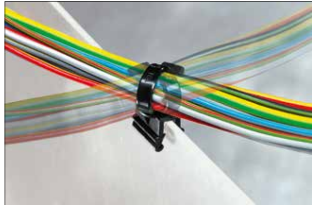
EdgeClip CBTO50R, rotatable 90°.