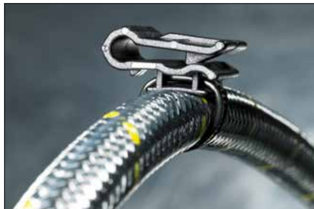
The holding tab increases the tensile strength additionally.