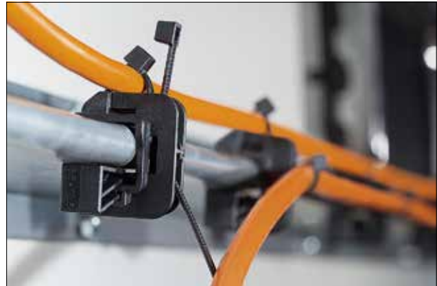
The Beam Clamp can be fixed onto a beam with a wedge. Up to two bundles can be routed on the top or rear side of the clamp.