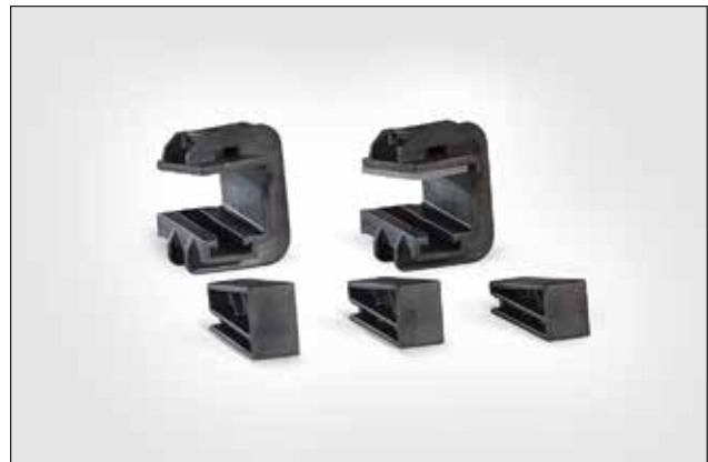
Our two Beam Clamps with 3 different wedges for diverse sheet thicknesses.