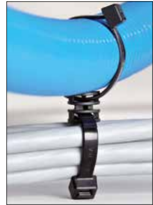
The second tie can be used for post-installations.