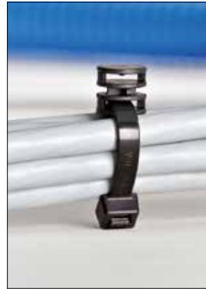
T120RCOUPLER can be used for parallel routing of two cable ties.

Material specification please see page 22.