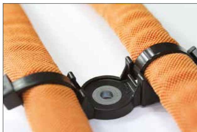
DHDM for parallel routing of bundles.