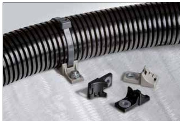
These HDM are suitable for assembling on screws.