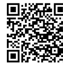
Application video: Q-Series