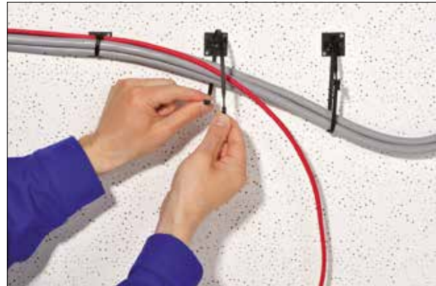
Q-ties can be used for both temporary and final cable installation.