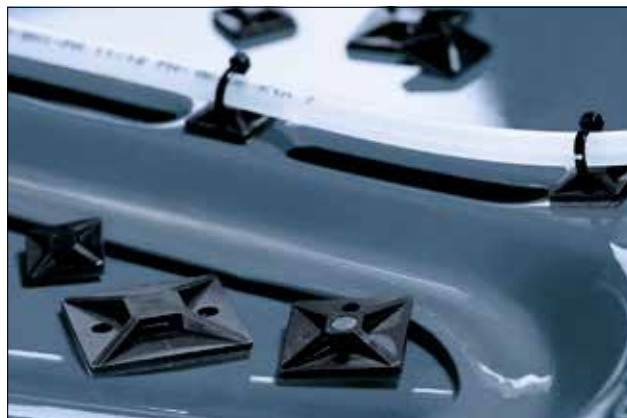
SolidTack products work on varnished and powder coated surfaces.