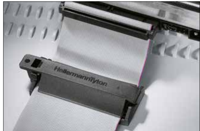
Based on extremely soft wings any flat cable is gently fastened.