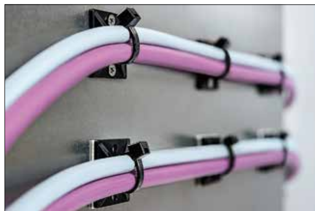
MB-Series Mounts with square design / screwable, self adhesive.