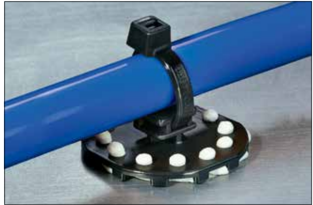
PMB5 mount with paste adhesive.