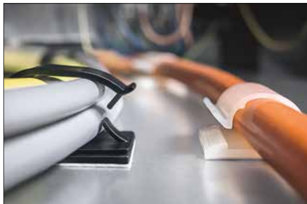
Self adhesive one piece fixing mounts RB20 (l) and RB14 (r).