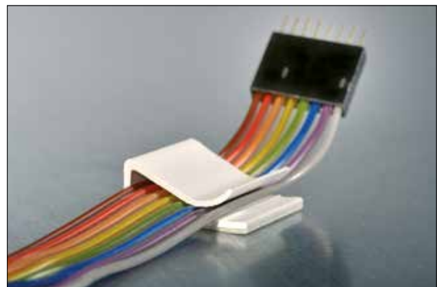
130100 self adhesive mount for flat cables.