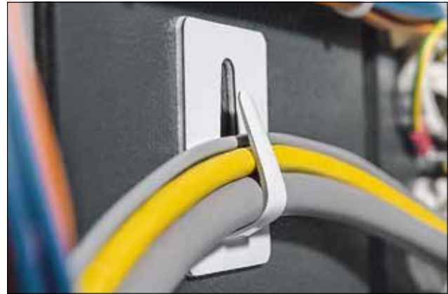
Malleable tongue allows for a variety of sizes per clip.