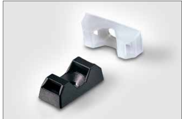
Q-Mount, CTQM 2-way entry, screwable.