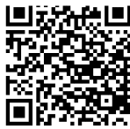
Application video: Q-Series