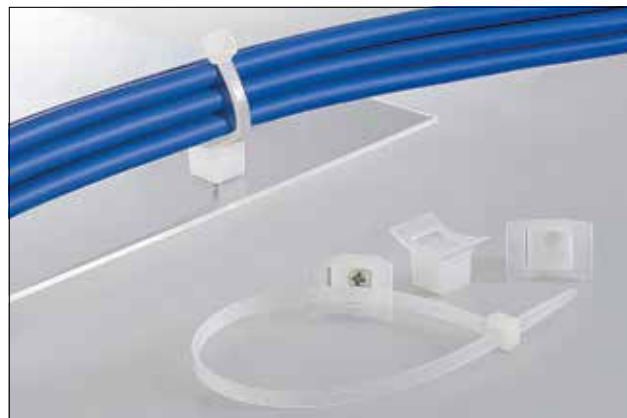
Cable Tie Mounts LKC Series.