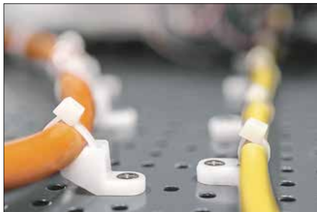
LKM, CL8 and FH cable tie mounts for applications with limited space.