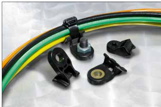
Heavy Duty Mounts HDM-Series, Patent Number US5820083.