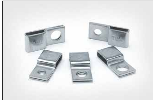
Stainless Steel P-Mount SSPC for use in arduous environments.

i The SSPC-Mounts can ideally be combined with the MBT cable ties on page 82–88 and with the MST and MLT cable ties on page 89, 90.