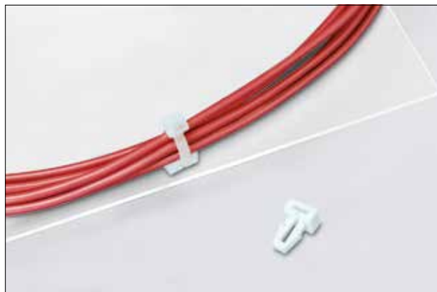
TM1SF Fixing Base for pre-drilled or pre-punched holes.