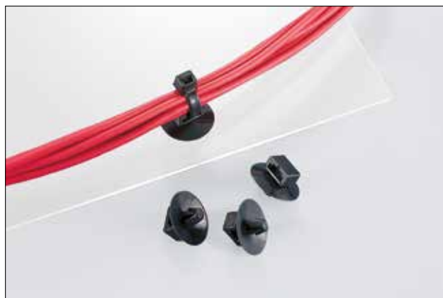
Securely fix and route cables and pipes with SFC3.