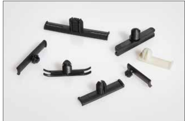
BundlingClips with fir tree bases for a variety of applications with a wide range of metal thicknesses and drill holes.