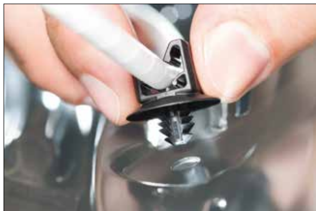
The HC48FT6 is designed for Bundle diameter 4.3 - 5.2 mm.