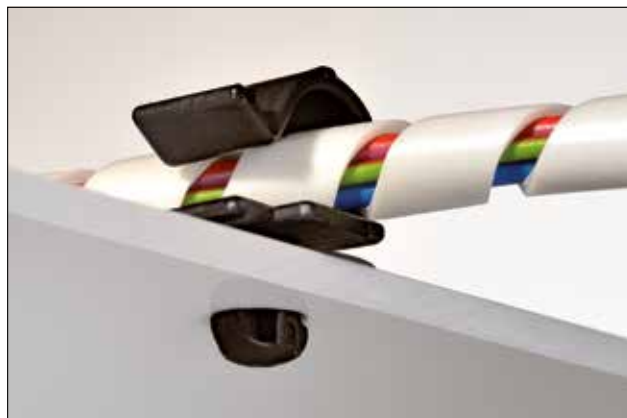
The very low arrowhead is specially designed for narrow installation spaces.