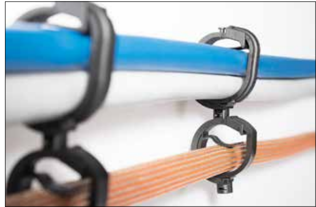
IAHC( )AH in combination with an IAHC( )T.