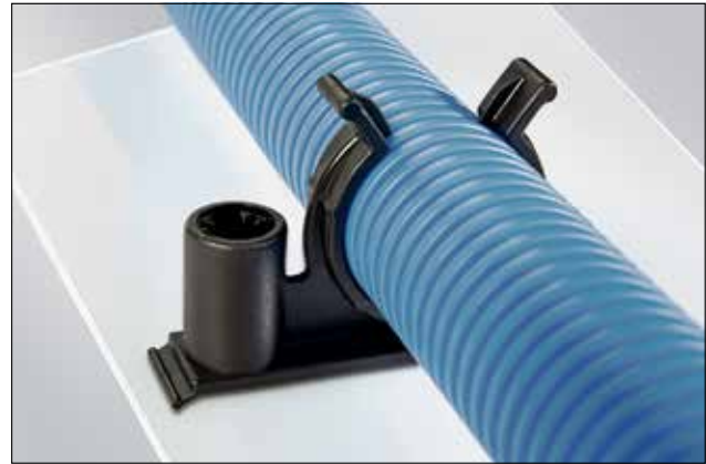
The tubing is clicked into the CTC clamp and is held firmly.