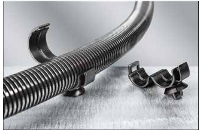
Simple and secure installation of pipes or hoses to panels.