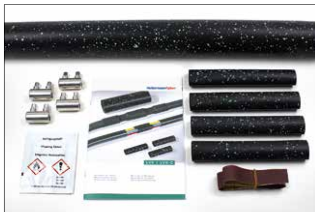
LVK-C: Outer sleeve, inner sleeves, mechanical connectors, cleaning cloth, emery cloth, installation instructions.