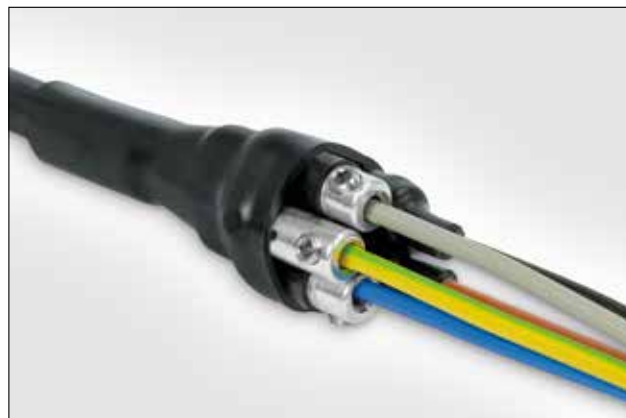
LVK-C - Heat shrinkable straight-through joint with connectors.

Outer sleeve, inner sleeves, mechanical connectors, cleaning cloth, emery cloth, installation instructions