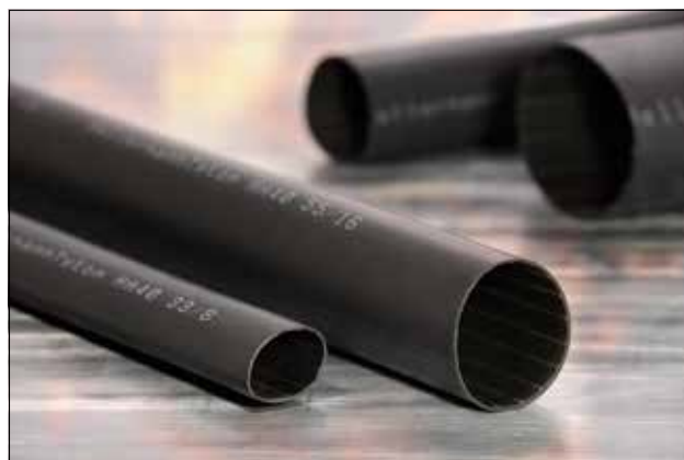
HA40 thick wall, adhesive lined and flame retarded tubing for shipbuilding applications.