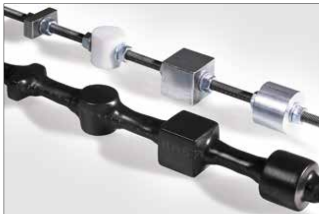
Due to the high shrink ratio HA67 is suitable for complex shapes and dimensions.