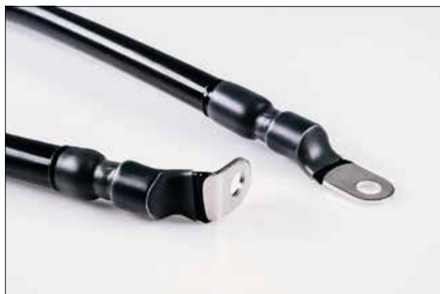
Heat shrink tubing SA47-LA for cable connection.

Cut lengths available on request. Please contact us!