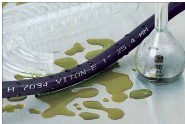
Viton® -E for flexibility and protection against aggressive chemicals.