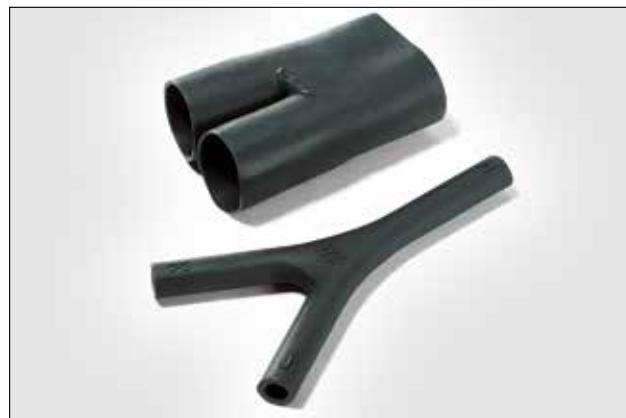
492H412-415 Series supplied / fully recovered.

For Material / Adhesive information please refer to page 260, 261.