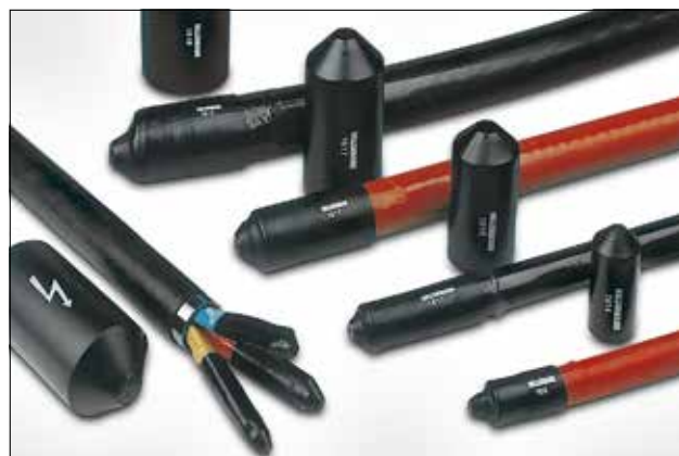
The appropriate end cap for every cable diameter, and cable types.