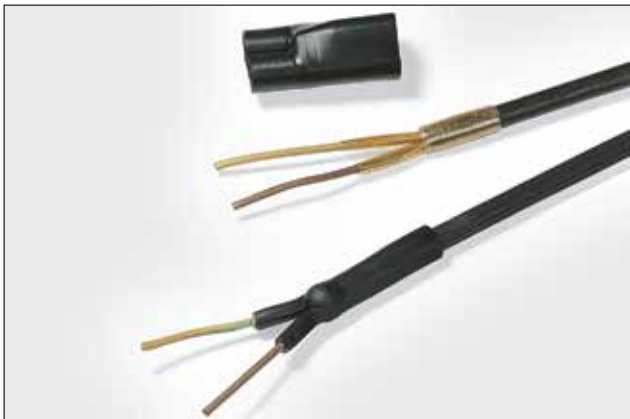
Adhesive tape HMT200A for sealing against humidity.