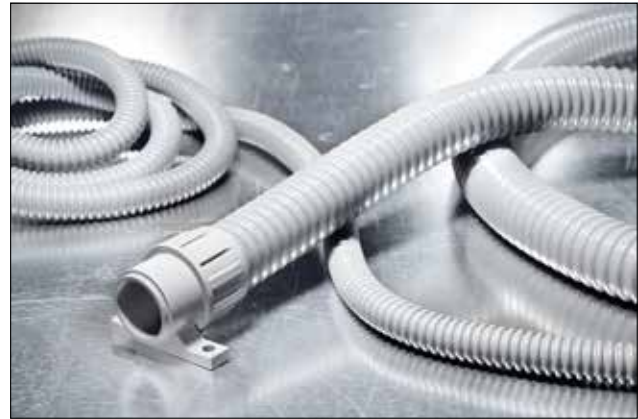
FlexiGuard FG with FG-UH fitting.