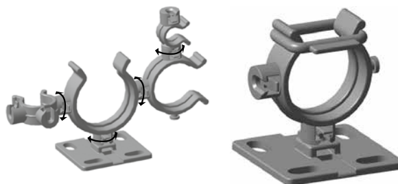
Multiple clips can be joined. Clips swivel freely.