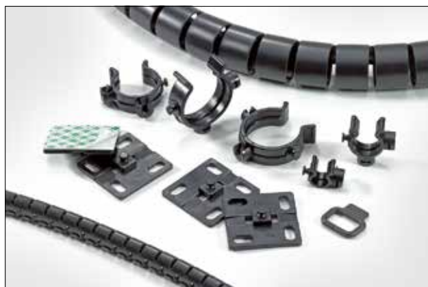
The Helawrap accessory set for bundling, protecting, mounting and routing cables.