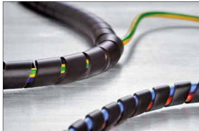
Spiral binding SBPAV0.