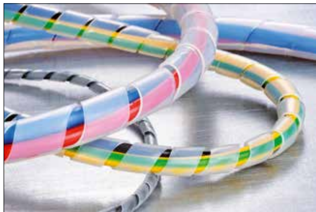
Spiral binding SBTFE is ideal for extreme conditions.