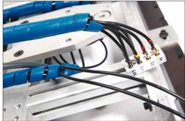
Detectable, metal-content spiral binding protects cables on food-processing machines.