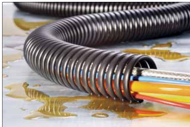
Spiral binding SPS is very robust and provides good protection against oil.